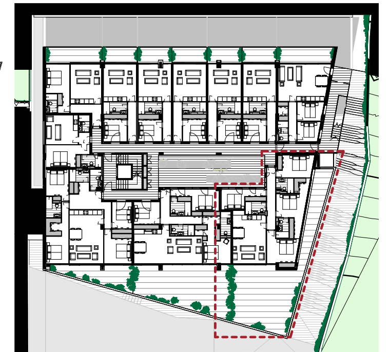
APARTMENT LOCATION. THIRD FLOOR 1 : 500