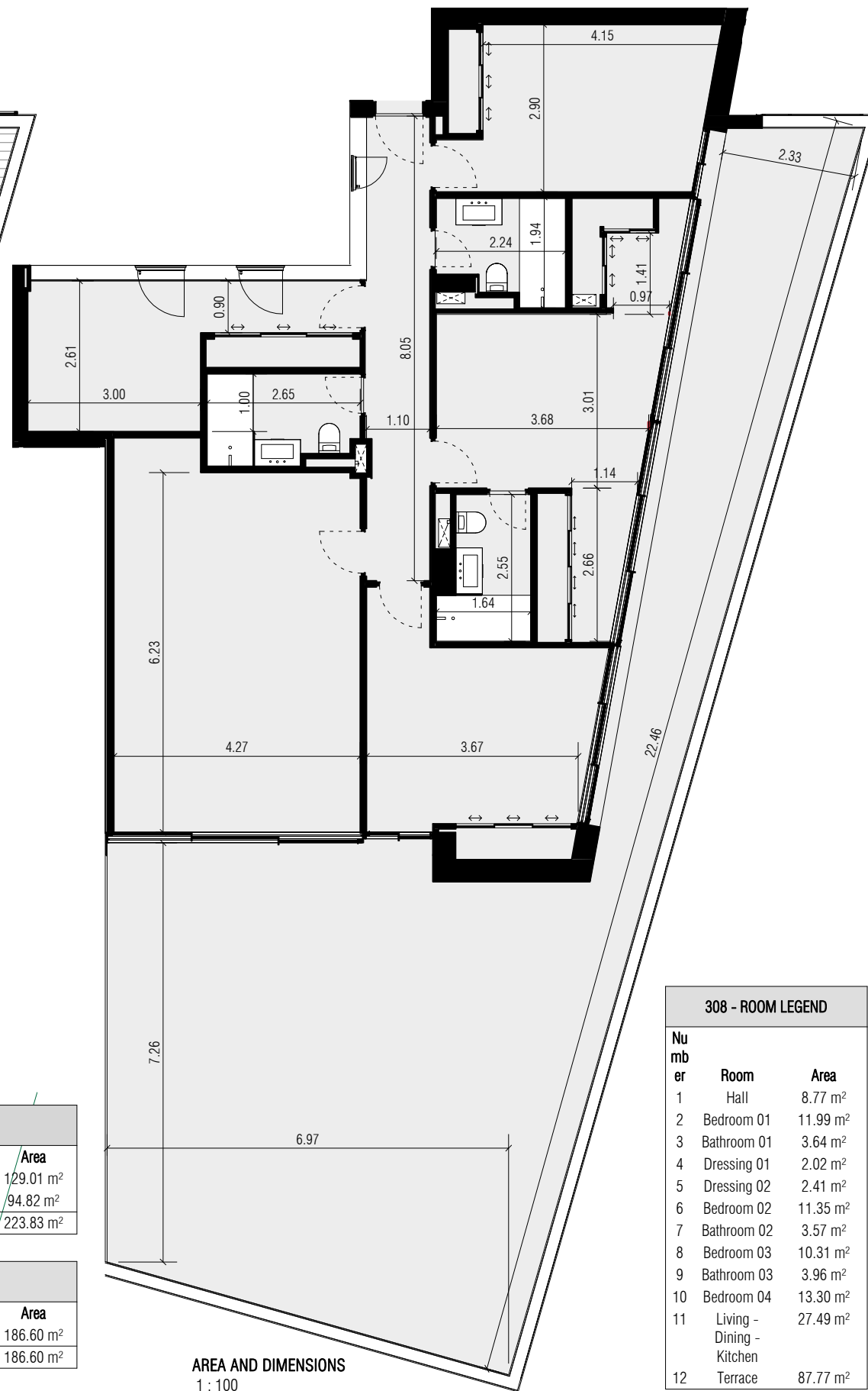
AREA AND DIMENSIONS 1 : 100