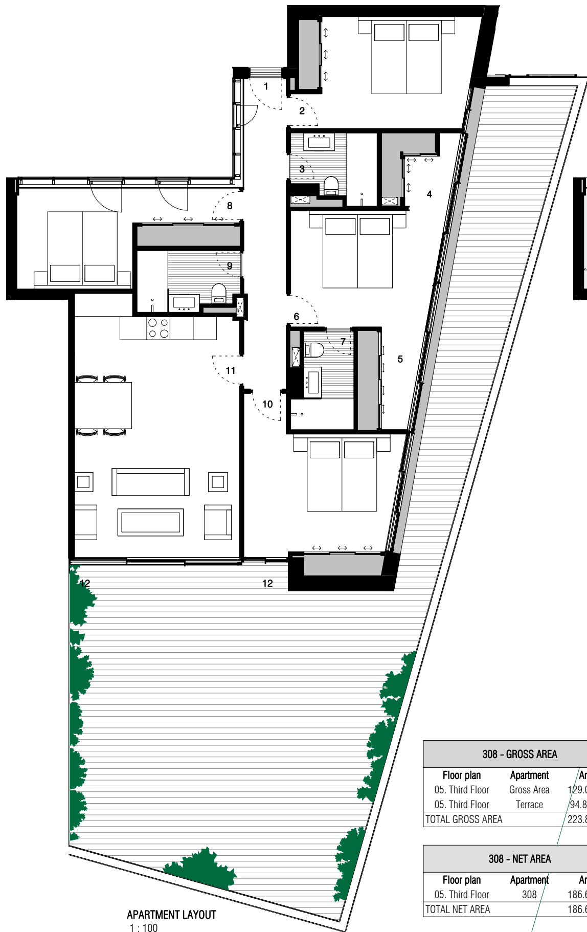
APARTMENT LAYOUT 1 : 100